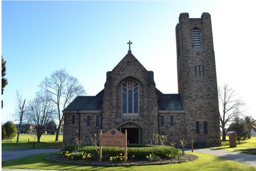
HMAS Cerberus Protestant Chapel of St Mark, Crib Point, Victoria