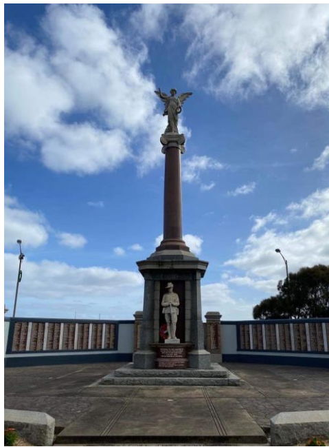
Warrnambool War Memorial