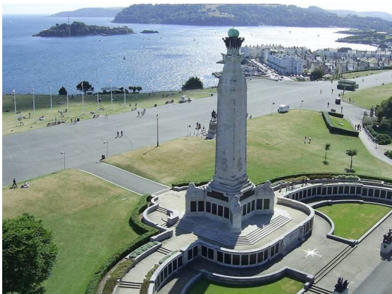
Plymouth Naval Memorial

Plymouth Naval Memorial commemorates 7,251 sailors of the First World War and 15,933 of the Second World War. (Information from CWGC)