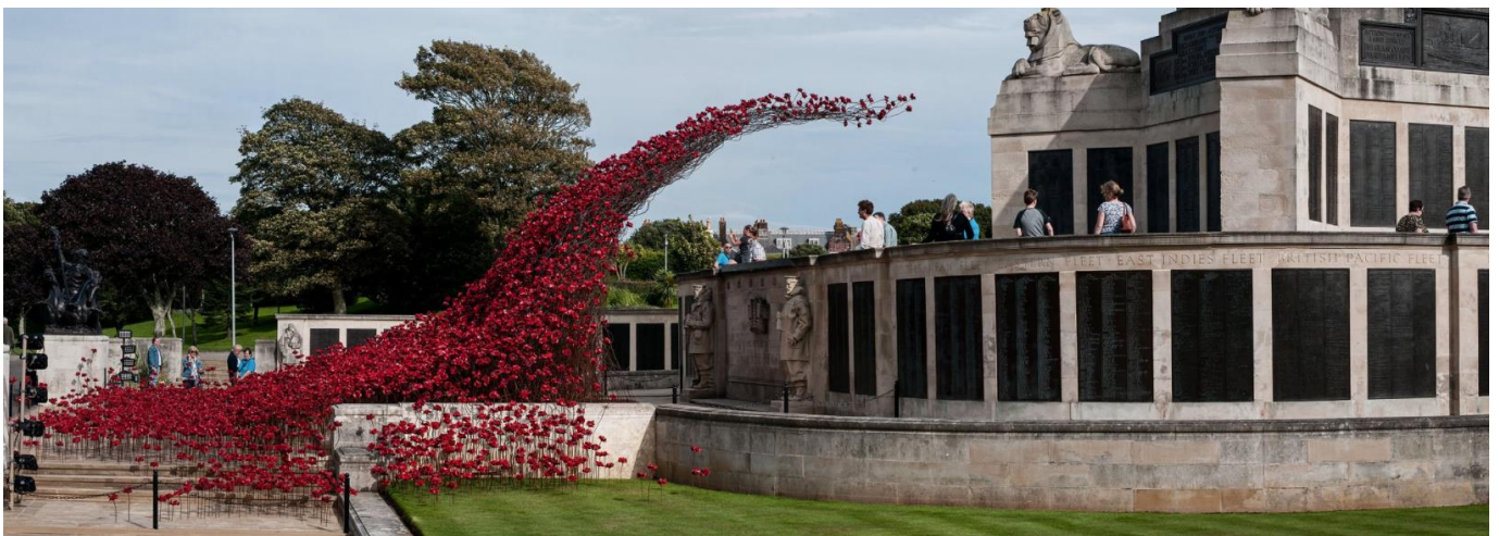
Poppies Wave at CWGC Plymouth Naval Memorial